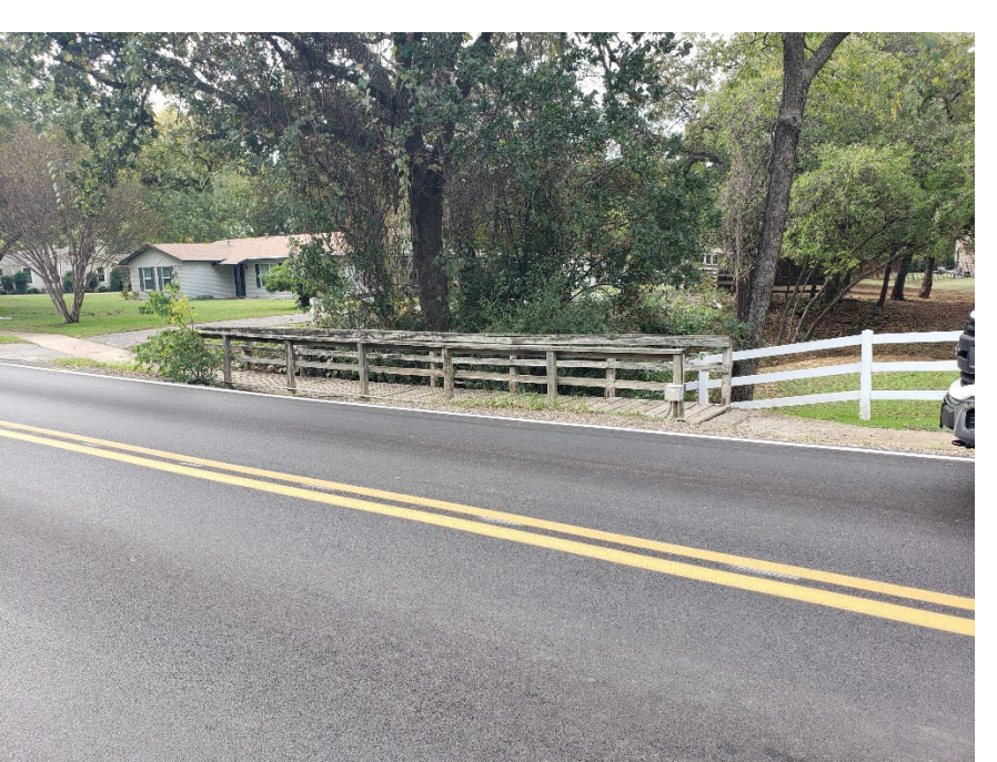
Looking East on Roosevelt (Box Culvert)

Looking South on Roosevelt (Sidewalk Bridge)