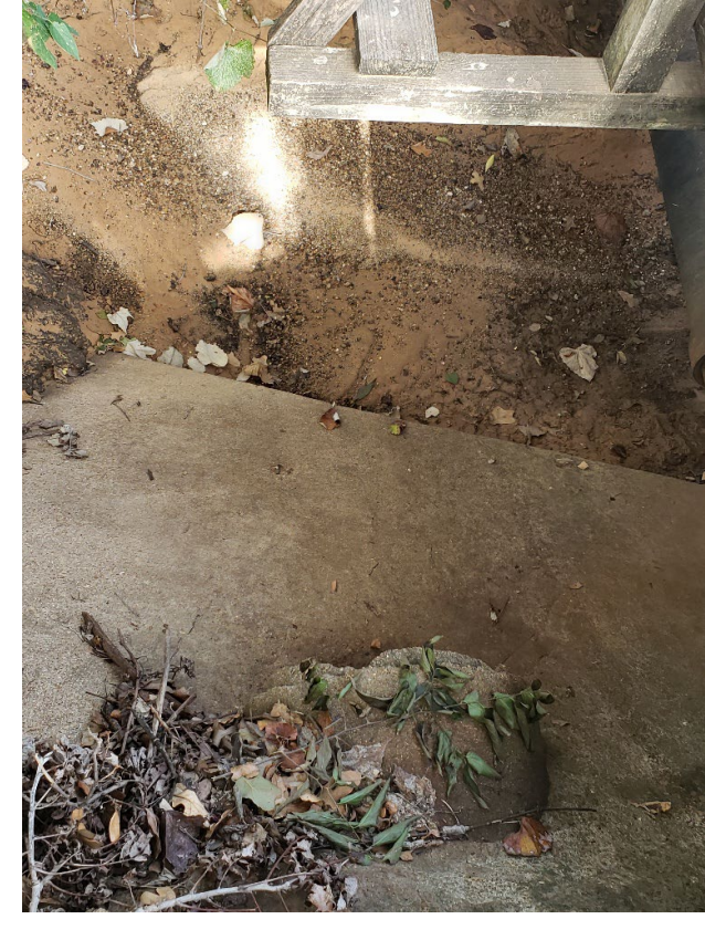
Water is undermining the Embankment