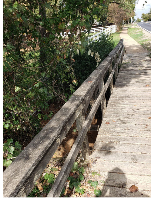
Unknown why these wood planks are on the side of the bridge. Currently they are supporting the dirt shoulder or rotted away.