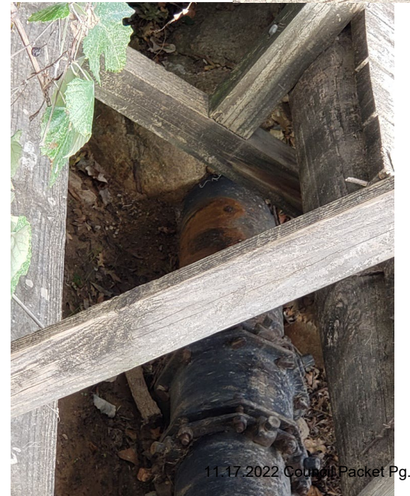
acket Pg.72 of 92